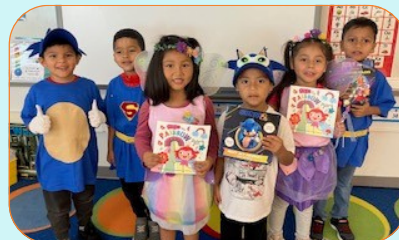
Children from Woodburn Elementary happily wear their costumes and carry their books.

Our goal is to prepare 125 costumes with books and tote bags for children who attend five Title I schools. But we can't do this without you! Interested? Contact denise@kidsgiveback.org for details.