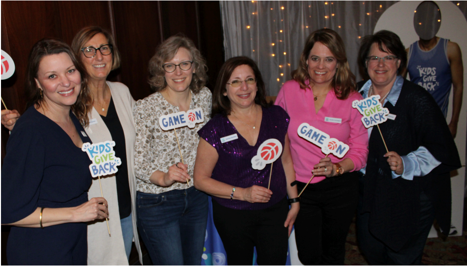
Members of the Kids Give Back Board of Directors and Staff