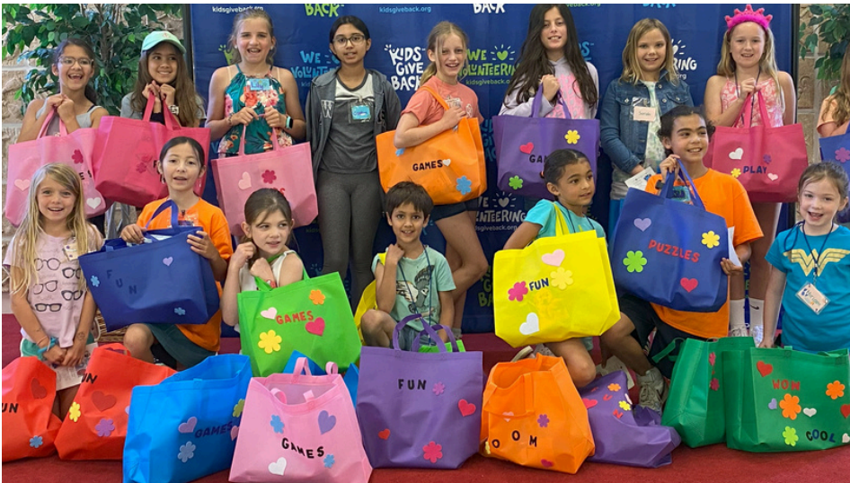
Kids show-off family Game Night Bags.